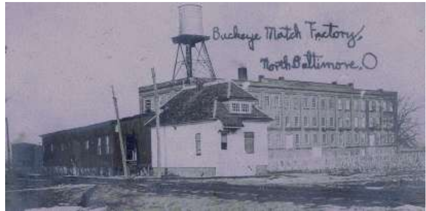
The Buckeye Match factory as it appeared, circa 1908

The Buckeye Match factory was located at 331 East Cherry Street in the early 1900s. Company offices were located in the white wooden building in the foreground. The two dark wooden buildings behind the office were warehouses built alongside the Cincinnati, Hamilton, and Dayton (CH&D) railroad tracks. The 12,000 gallon water tower was 24 feet above the roof of the three story brick factory building. The factory's first floor was used for making the matches. Boxes of finished matches were placed on the second floor, and the third floor was used for storage.